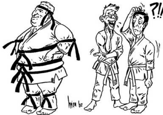
This is our new Sensei, he holds black belts in eight different martial arts.

Congratulations to all students who received their promotions.